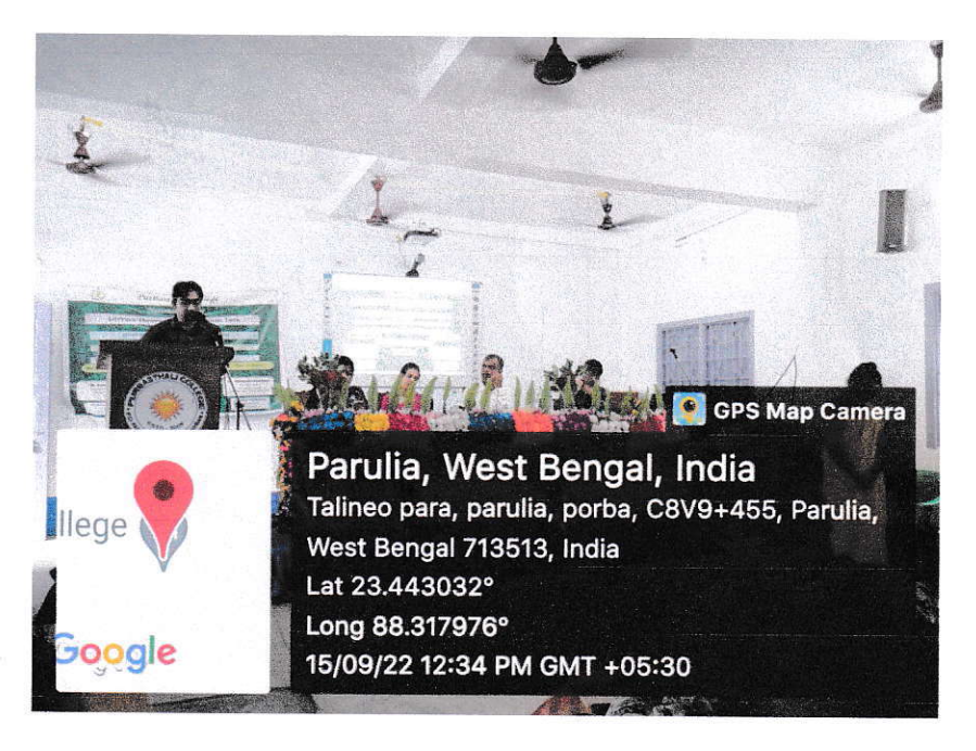
Fig. National Seminar on "Literary Theory and the Linguistic Turn", in collaboration with IQAC, and Katwa College on September 15, 2022

Department of English Purbasthali College Parulia, Purba Bardhaman